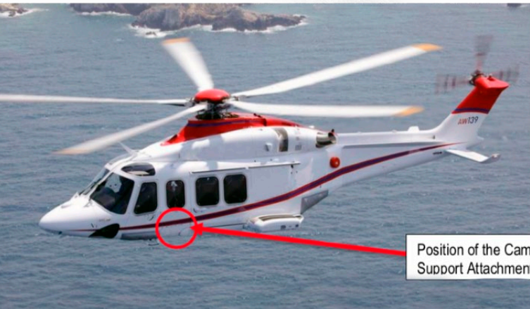
Position of the Camera Support Attachment points